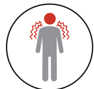
FEVER, OR SHIVERING, OR FEELING VERY COLD