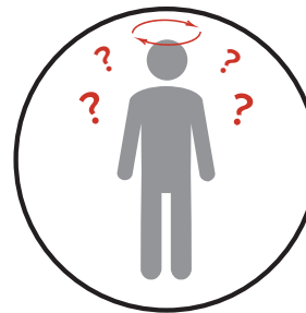
CONFUSION OR DISORIENTATION

Symptoms of sepsis can include any one or a combination of the following: