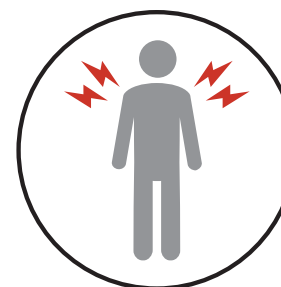
EXTREME PAIN OR DISCOMFORT