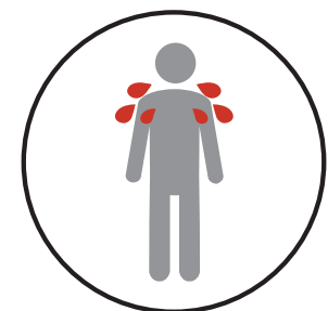
CLAMMY OR SWEATY SKIN